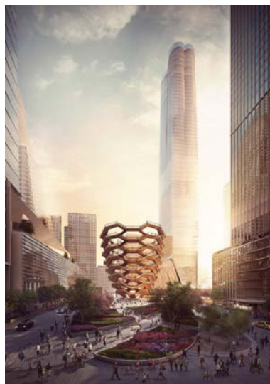
Hudson Yards Centerpiece Begins to Rise A rendering of the Vessel landmark at Hudson Yards.