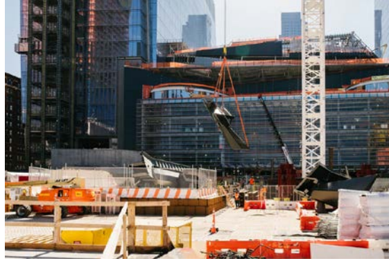
Hudson Yards Centerpiece Begins to Rise A 100,000 steel piece of Vessel swings into place at Hudson Yards.