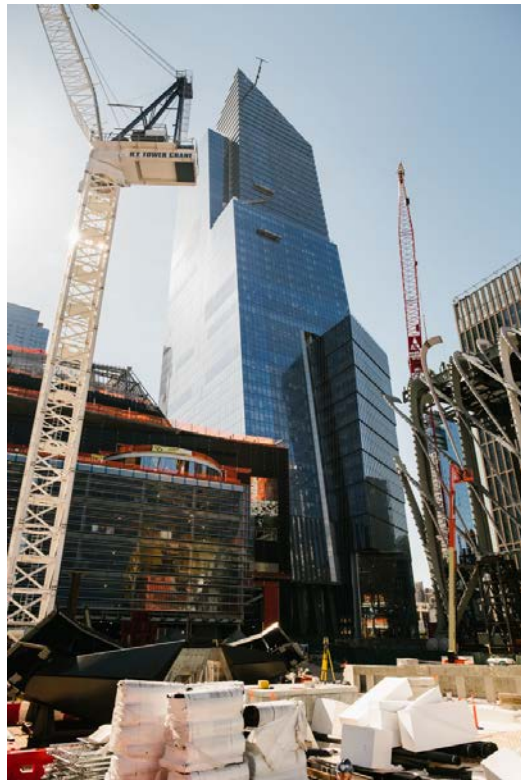
Hudson Yards Centerpiece Begins to Rise 10 Hudson Yards.