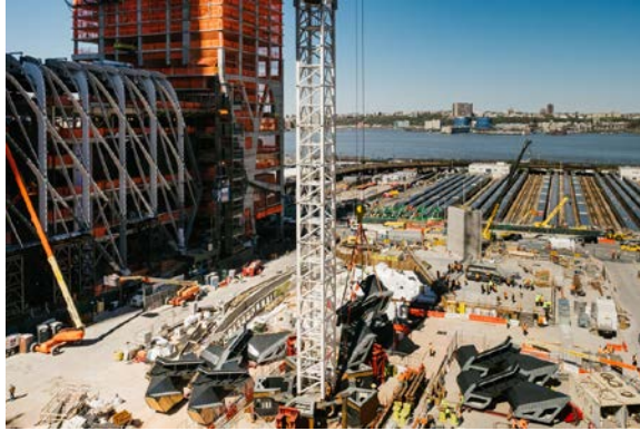
Hudson Yards Centerpiece Begins to Rise A view of the Hudson Yards construction, Culture Shed at left.