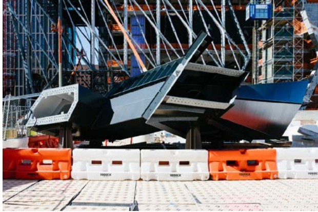
Hudson Yards Centerpiece Begins to Rise A piece of the Vessel.