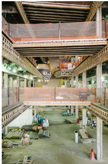
Hudson Yards Centerpiece Begins to Rise Inside the Shops and Restaurants at Hudson Yards.