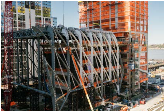
Hudson Yards Centerpiece Begins to Rise The Culture Shed under construction.