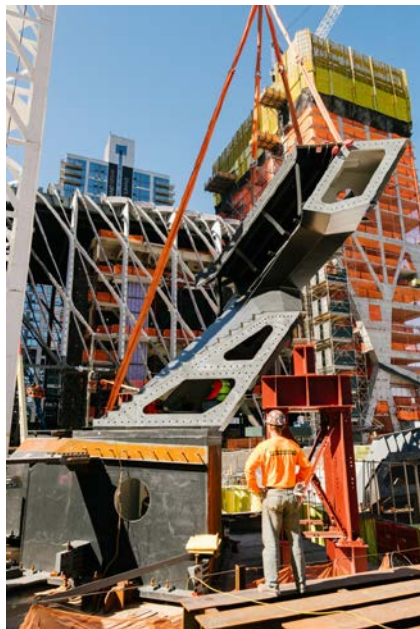
Hudson Yards Centerpiece Begins to Rise A 100,000 steel piece of Vessel swings into place at Hudson Yards.