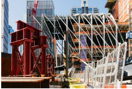
Hudson Yards Centerpiece Begins to Rise The Culture Shed under construction.