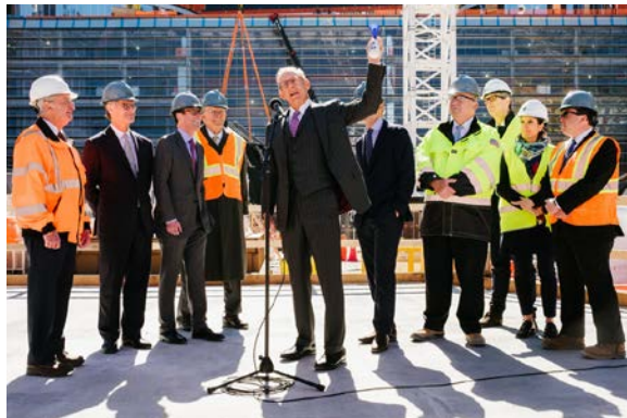
Hudson Yards Centerpiece Begins to Rise Stephen Ross presides over the ceremonial start of the Vessel construction.