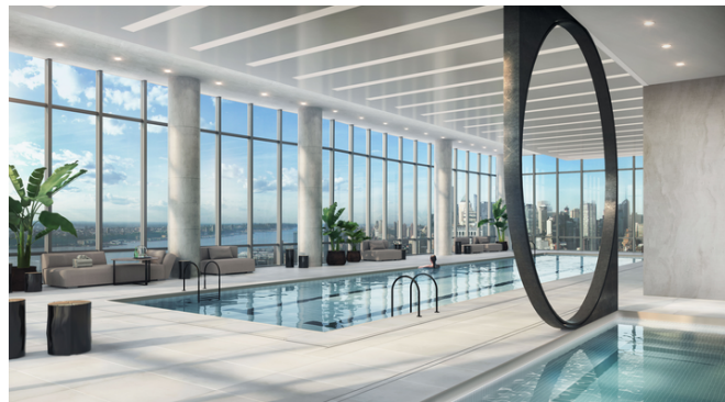
The 15 Hudson Yards aquatic center.

At 15 Hudson Yards, the first residential building opening at the Hudson Yards development in New York, the 51st floor has two corner dining rooms that offer panoramic views of the skyline, the Hudson River and the rest of the Hudson Yards development