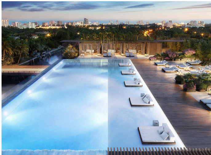
The rooftop pool lounge at The Ritz-Carlton Residences Miami Beach.

http://www.mansionglobal.com/articles/49109-hot-amenities-in-2017-run-the-gamut-from-tween-lounges-to-automated-parking