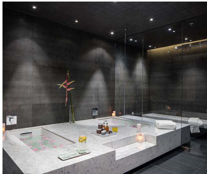
The hammam spa at Brickell City Centre. brickellcitycentre.com

At Brickell City Centre, a mixed-use development in Miami that recently opened, the hammam is made of marble and blush hammered black stone.